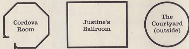
Lobby Level Rooms